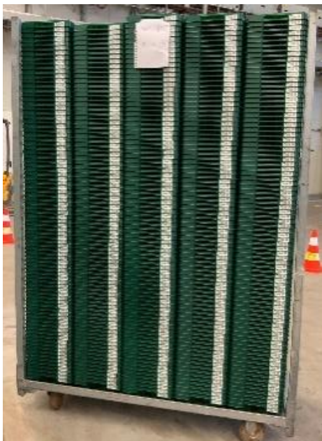
EPT 400 on CC Containers without shelves At least the top should be secured once with foil

Stickers and labels must be removed as far as possible before delivery to an EPT depot.