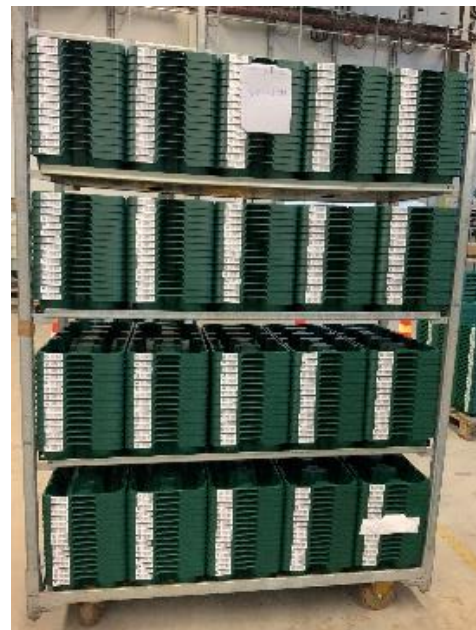
EPT 400 on CC Containers with shelves Additional securing of the load is not necessary