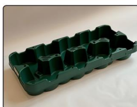
EPT 200 (6/CC Layer)

8 – 10 x 10,5-13 cm GTIN 4262480837750 GRAI 800304262480837750XXXXXXXXXX